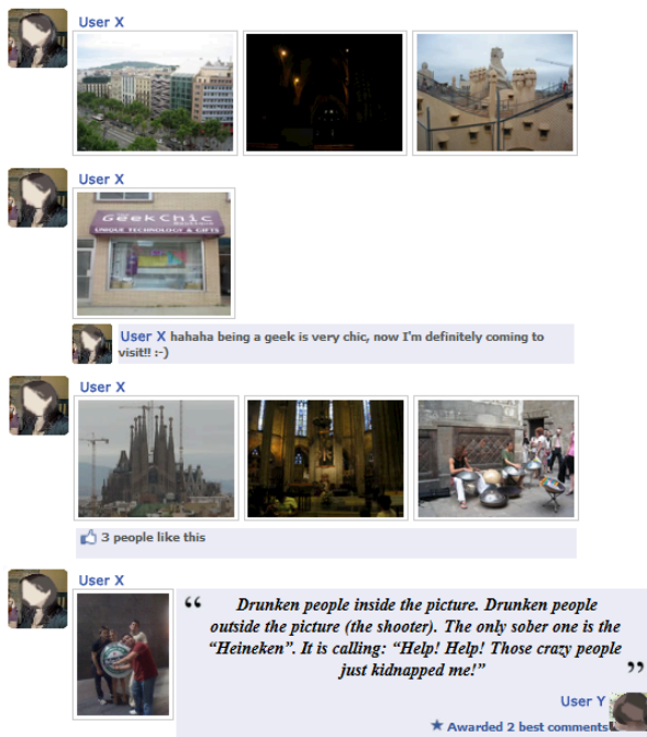
Figure 2. Web interface of the self-promotion experiment. Four different multimedia presentation techniques in Facebook style were evaluated: Random photos ( PhotoRnd ), Random comment ( CommRnd ), Best photos ( PhotoBest ), Best comment ( CommBest ). The faces and the names of the participants have been anonymized

The four different feeds correspond to the multimedia presentation techniques that were evaluated in this study: (1) PhotoRnd – three photos chosen randomly from the album, (2) CommRnd – one photo and associated comment selected randomly, (3) PhotoBest – best three photos as selected by the PhotoBest quality control mechanism, and (4) CommBest – the photo and associated comment as selected by the CommBest quality control mechanism presented above.